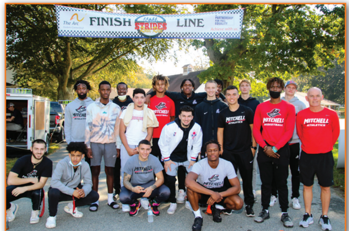
Our great 2021 Strides volunteer team from Mitchell College

T: 860.889.4435 x116 E: dtift@thearcect.org