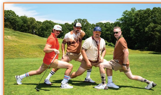
Best-dressed golf team 2022