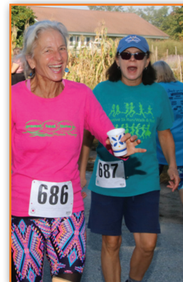
Two of 2021's happy race finishers

There'll be great food and swag, fabulous raffle items, and prizes for top finishers. <