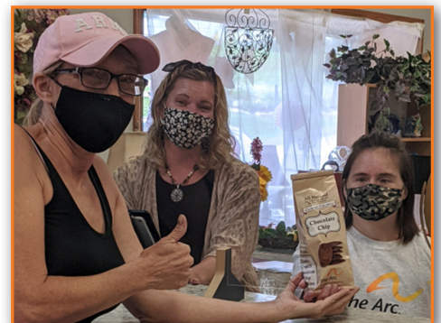
A happy Emporium customer

Our Emporium is Open! Fans of high-quality used clothing, furniture and housewares were thrilled to see The Arc Emporium at 22 Rt. 171 in Woodstock open once again as of this past March . Hours are Monday-Friday 10:00 am -2:30 pm. Business is booming—please stop by! <