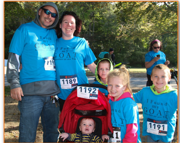
Teams of all sizes are welcome!

or 10k courses starting at Camp. It's always a beautiful day at Camp Harkness, with good food, great swag for every runner, games for kids, professional race timers, and cash prizes for the winners in a variety of categories.