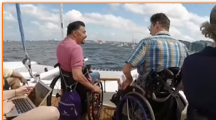
The Impossible Dream's accessible deck