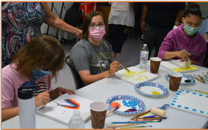
Artists at work

“The Clubhouse model has been going since April,” reports Crystal. “We have about 100 participants so far. Everyone’s really happy with it.” The Arc facilities in Gro-